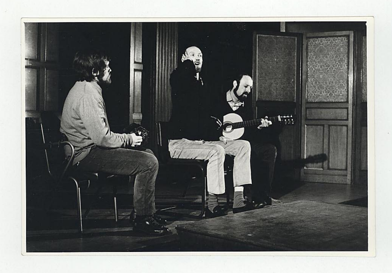
Figure 11.1 Ewan McColl accompanied by John Faulkener, London c1968.